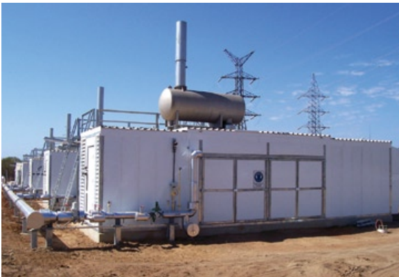
Moronbah coal seam methane power plant — Queensland, Australia