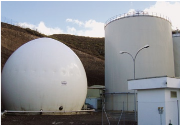
Salto del Negro garbage digester — Las Palmas de Gran Canaria, Canary Islands