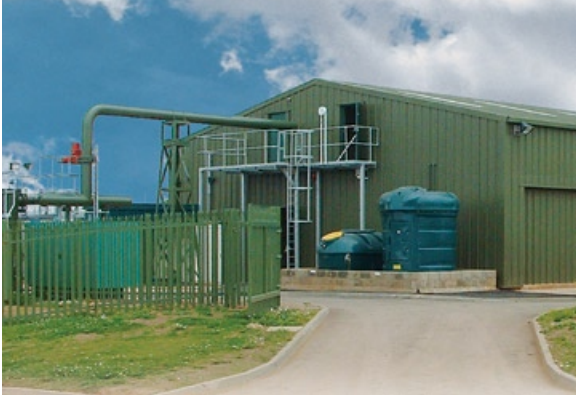
Viridor municipal landfill — Edinburgh, Scotland